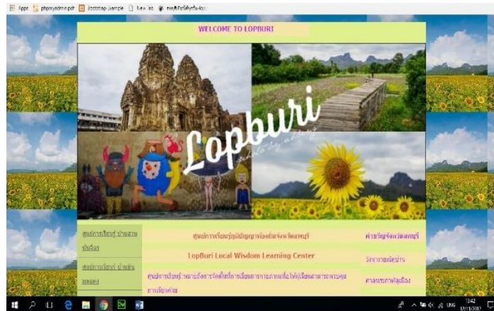
Figure 2 - Home page

The three sections of the website introducing local wisdom in Lopburi Province are as follows: the history of the province; page by page, the test will be conducted, and the findings will be used to improve until desired outcomes are achieved. as depicted in Fig. 2.