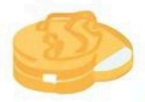
Tearmaad and punt