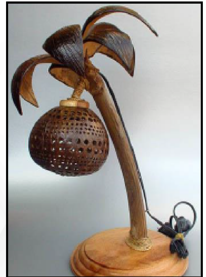
จาก lamp the world save the world, โดย Patchara, 2554.